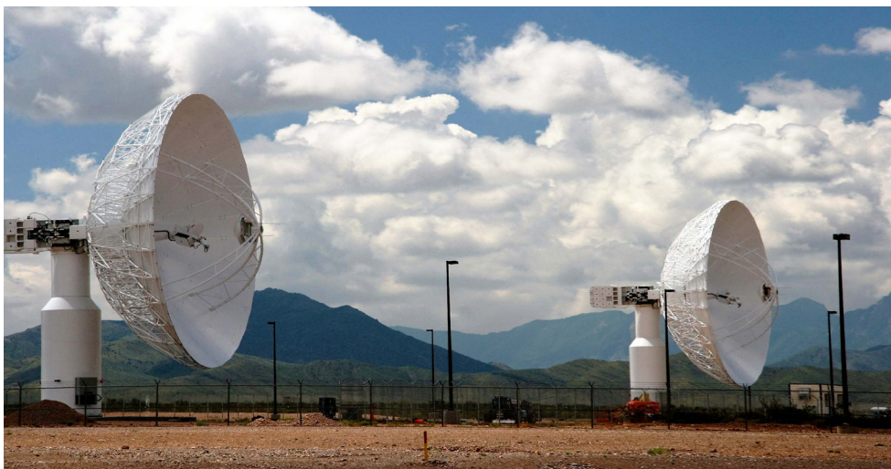
Part of Goddard's Near Earth Network is located in White Sands, New Mexico.

As CubeSats adopt higher quality flight radios, Near Earth Network managers are preparing to support upcoming NASA CubeSat missions. By connecting to the Near Earth Network — which is managed, operated, and maintained by Goddard — CubeSats will be able to tap into a vast network of tracking stations to transmit science data quickly and securely. Of Goddard's upcoming CubeSat missions, petitSat, GTOSat, and BurstCube likely will be supported by the Near Earth Network. Going