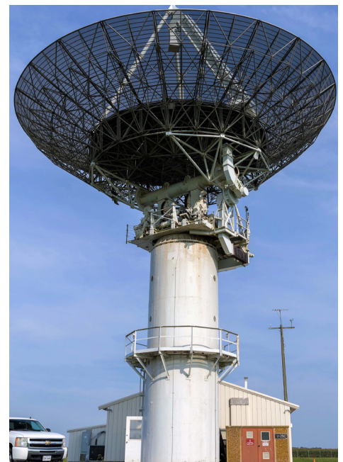
The UHF ground station is based at Goddard's Wallops Flight Facility.

For small satellite missions operating in the UHF band, the Wallops UHF ground station can facilitate SmallSat downlinks and uplink commanding. Seven missions – HaloSat, Dellingr, TEMPEST-D, CubeRRR, Shields-1,