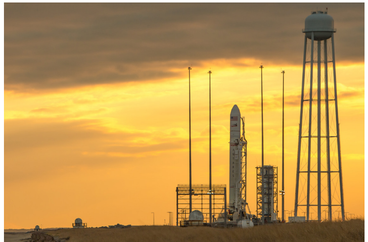
The Mid Atlantic Regional Spaceport is located at Goddard's Wallops Flight Facility in Wallops Island, Virginia.

NASA uses sounding rockets because they are simple, quick and cost-efficient platforms for conducting preliminary research and testing. These suborbital missions send payloads into space for a brief amount of time, typically under 30 minutes. In some cases, the payload returns to Earth on a parachute and can be recovered.